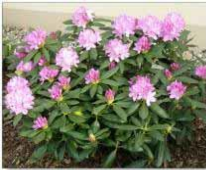
Rhododendron — Catawba (for shadier areas)