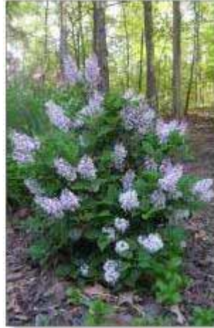
Lilac Miss Kim