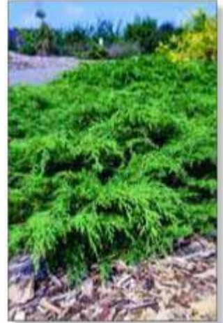
Russian Cypress (Ground Cover)