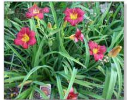
Daylily — Ruby Stella (Ever-blooming Variety)