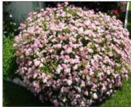
Spirea Little Princess