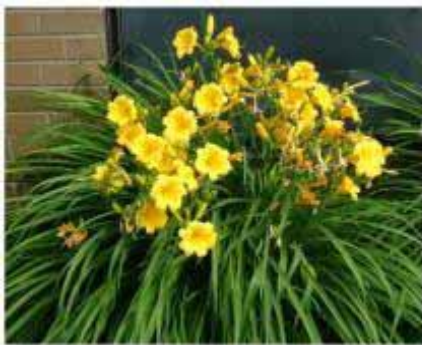
Daylily — Stella D'Oro (Ever-blooming Variety)