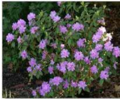
Rhododendron — PJM (for sunnier areas)