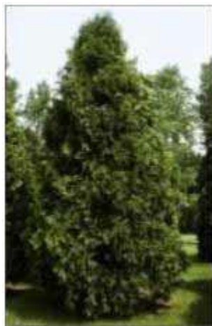
Arborvitae Dark American