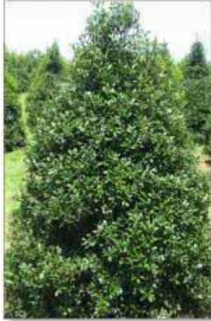
Holly Blue princess