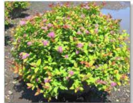
Spirea Magic Carpet