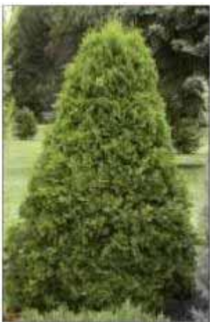
Arborvitae Emerald Green